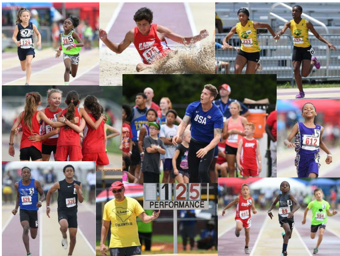
USATF-SC JO Meet June 21-23, 2019

City of Rock Hill York County Tourism Winthrop University Mitchell Timing Lexington County City of Myrtle Beach Greenville County Parks & Rec Square One Events Columbia International University CKET Timing Strictly Running SCMileSplit