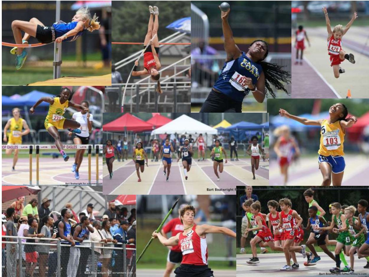
USATF-SC JO Meet June 21-23, 2019